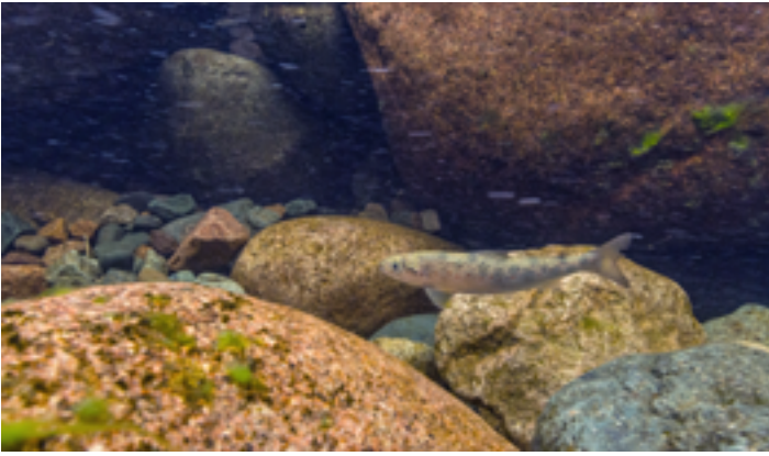
Juvenile Atlantic salmon in a freshwater stream.

(Borggaard et al. 2019). These efforts have led to science and management actions that include efforts to identify climate-resilient habitats within the range of the Gulf of Maine DPS and to develop strategies to ensure access to, and protection of, these habitats. We will advance these efforts by completing an ongoing study to identify river reaches that are rich in baseflow during summer low-flow periods, and thus have the potential to be high-value Atlantic salmon habitat.