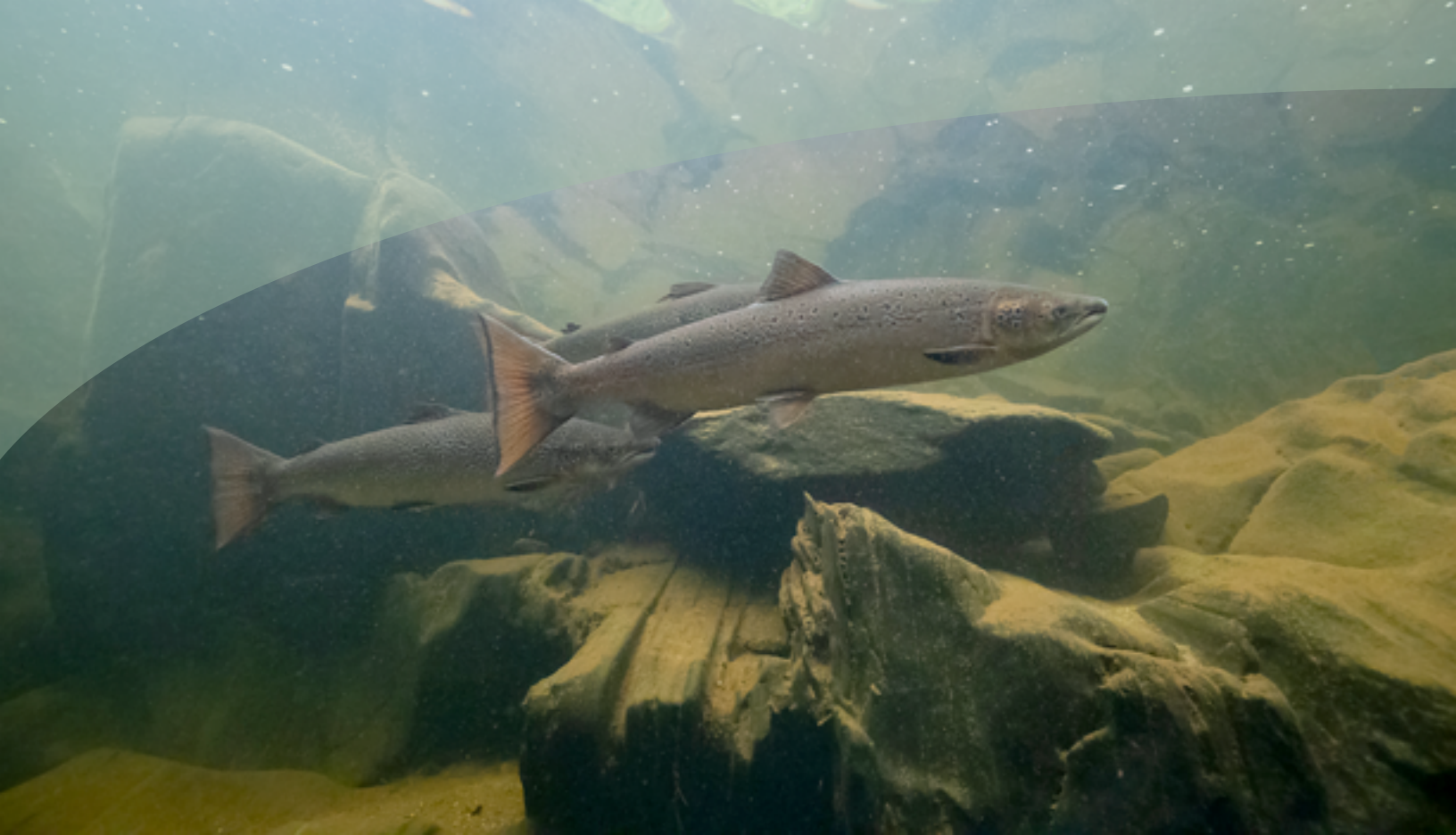
Adult Atlantic salmon in the Sandy River in western Maine.