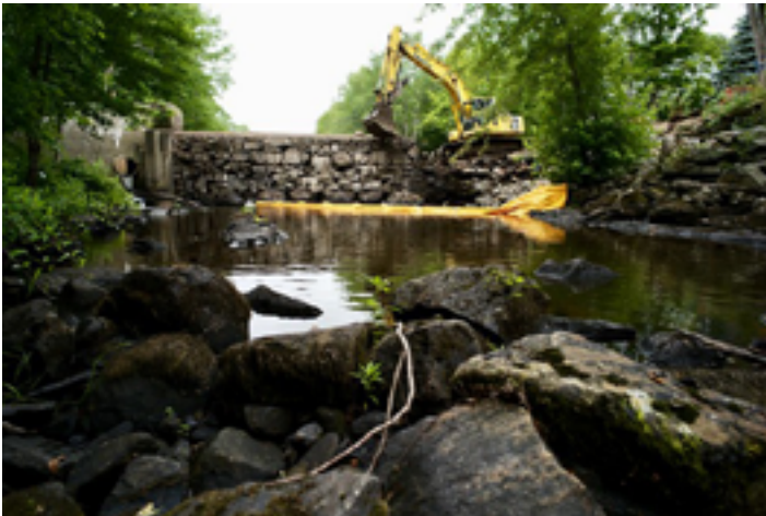
The removal of the Coopers Mills Dam on the Sheepscot River in Maine.

High-quality habitats, including cool water rivers and tributaries, still exist throughout the State of Maine; however, the Gulf of Maine DPS of Atlantic salmon only has unimpeded access to 8 percent of its historic freshwater habitat.