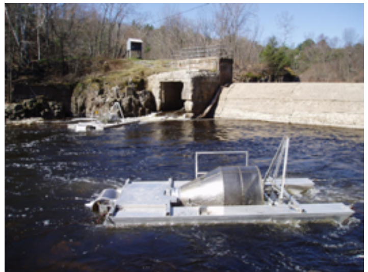
Rotary screw traps fishing below the Head Tide Dam on the Sheepscot River. These traps allow biologists to capture migrating fish with minimal injury to conduct population estimates and sample fish size, age, and condition.

Since Atlantic salmon was designated as a Species in the Spotlight in 2015, measurable progress has been made toward improving connectivity within the Gulf of Maine DPS. Barrier removal and fish passage projects over the past 5 years have improved access to over 500 miles of stream and river habitat. In 2018 and 2019, the Atlantic Salmon Federation removed one dam (Coopers Mills Dam) and breached another (Head Tide Dam) on the Sheepscot River, which reconnected 60 miles of suitable