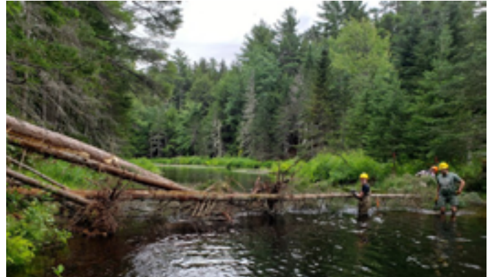
Installation of large wood by Project SHARE into degraded habitat in the Narraguagus River in eastern Maine.